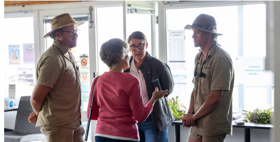
These key stakeholders include the Eastern Maar Aboriginal Corporation and the Apollo Bay Fishermen's Co-op.

In conjunction with the Authority, the Head Consultant will work with key stakeholders to help inform and prepare a draft Precinct Plan.