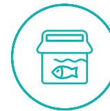
Upgraded Seafood Storage Tanks