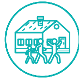
Provide Community and Event Spaces