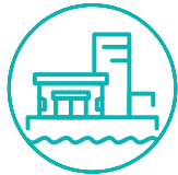
Form and Character of Development