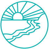
Coastal Adaptation Planning

Apollo Bay Harbour is set within a sensitive coastal environment that must be protected and enhanced. The form and character of development should be carefully considered to complement the surrounding landscape, ensuring that any new structures or upgrades integrate seamlessly with the coastal setting.