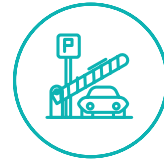
Formalised Public Parking