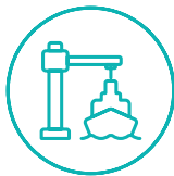
Local Port of Apollo Bay