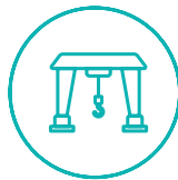
Slipway and Boat Repair Services