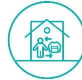
New Changing Huts