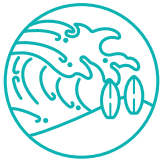
Mothers Beach, Point Bunbury and Marengo Beach