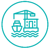
Strengthen Visual Connection to Harbour