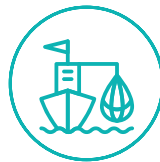
Commercial Fishing Industry