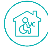
New Public Amenities