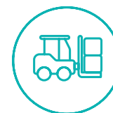
Wet Fish Market Services