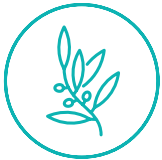
Native Flora and Fauna