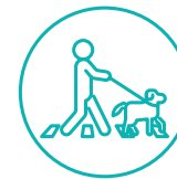
Cycle and Pedestrian Connections to Town Centre