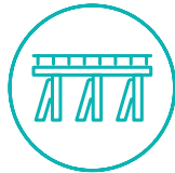
Improve Access and Connectivity