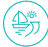
Access to Coastal Edge

Mother's Beach is a valued recreational area, but its facilities require improvement. There's opportunity to reconstruct the beach carpark and changing huts to improve access for beachgoers and harbour visitors while enhancing the site's overall functionality and visual appeal.