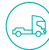
Safe Passage for Harbour Vehicles