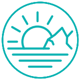
Preserve Waterfront Views

Enhancing the public realm within the harbour precinct presents an opportunity to create an engaging and accessible waterfront destination. A new viewing deck and seating area will improve public access, provide gathering spaces, and maximise scenic views of Apollo Bay Harbour and the Otway Ranges.