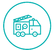
Emergency Vehicle Access