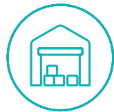
Upgraded Depot Building

The harbour's port operations depot plays a critical role in maintaining infrastructure and supporting maritime activities. An upgraded depot building will provide modernised operational space, and improved safety, security and functionality.