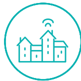
Multipurpose Meeting Rooms